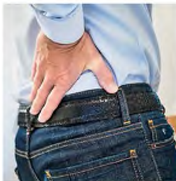
PROSTATE CANCER IS AMONG THE SOMEWHAT LESS AGGRESSIVE CANCERS AND CURABLE IF IT HASN'T

The type of treatment depends on several factors, including the patient's age, PSA level, biopsy result and any accompanying illnesses, points out Reichelt. If the patient is between 50 and 75 years of age and his cancer isn't at an advanced stage, the treatment is usually surgical removal of the prostate or radiation. While advanced prostate cancer is rarely curable, Reichelt says, in many cases it can be kept under control for several years with hormone, chemo- and immunotherapy. "Many men don't die of, but rather with, cancer carcinoma," he remarks. Doctors may recommend, for example, that an 80-year-old patient with a tumour that's not very aggressive not be treat-