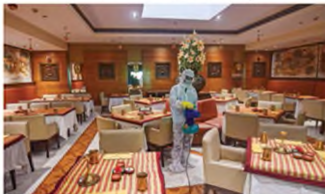
A worker wearing a PPE suit sanitises the sitting area of a restaurant that reopened after the easing of some Covid-induced restrictions in Kolkata on Tuesday.

Mumbai's Dharavi, for the second consecutive day, did not report a single case of Covid. The area has since January 2021 reported 6,861 cases and 359 deaths and at present has 13 active cases. The cases were much less in Mumbai too with 575 new detections. Delhi too saw a major dip on Tuesday as it recorded 228 new cases.