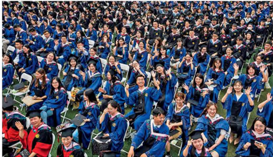
Nearly 11,000 graduates, including more than 2,000 students who could not attend the graduation ceremony last year due to the Covid-19 outbreak, attend a graduation ceremony at Central China Normal University in Wuhan, in China's central Hubei province.

"Risk of Covid-19 hospital admission was approximately doubled in those with the Delta variant of concern (VOC) when compared to the Alpha VOC, with risk of admission particularly increased in those with five or more relevant comorbidities," the authors of the study noted. "Both the Oxford-Ast-