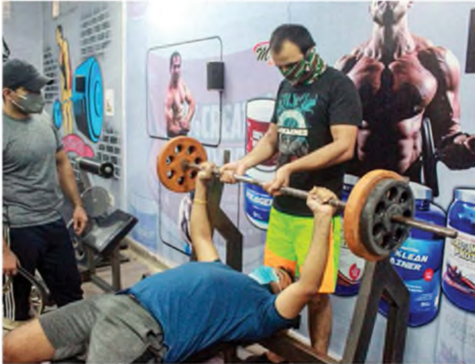
People workout at a gym which reopened after authorities eased restrictions in the ongoing Covid-19 lockdown in Gurgaon on Tuesday.